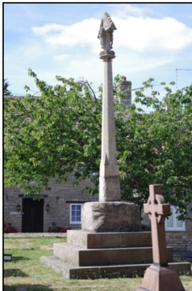
War memorial at St Andrew's Witham on the Hill

The NHLE is organised and is searchable by County Parish (CP) (which often consists of more than one village) within District within County e.g. Witham on the Hill in South Kesteven in Lincolnshire. An entry includes an Overview with photographs and a map, and the Official Listing