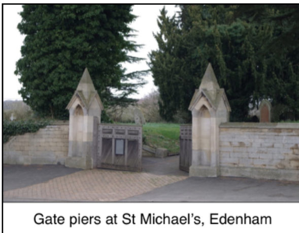
Gate piers at St Michael's, Edenham

In Edenham with Grimsthorpe and Scottlethorpe there are 49 listed buildings including Grimsthorpe Castle and St. Michael's Church both grade I, the gate piers of the church, Elm Terrace on the Scottlethorpe Road and the phone box on the main road all grade II. The listing for the gate piers reads "Pair of